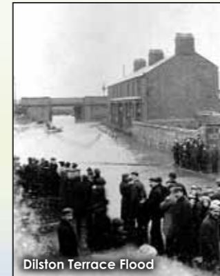
Dilston Terrace Flood