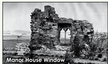
Manor House Window