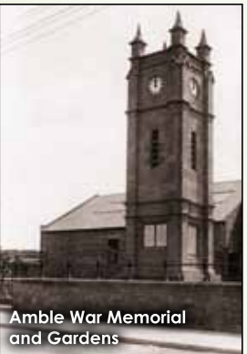
Amble War Memorial and Gardens