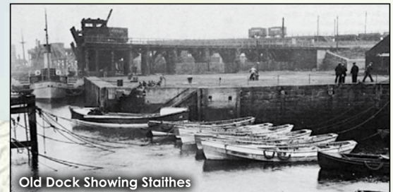
Old Dock Showing Staithes