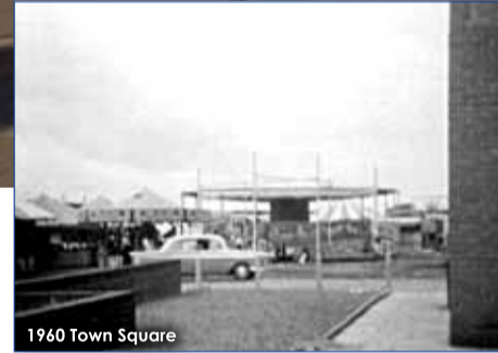
1960 Town Square

A sawmill opened in 1839. Before 1900, sailing ships and boats were constructed on the Braid, including some made of concrete which were exported to Mexico. Radcliffe Brickworks, before closing in 1958, produced 60,000 bricks a week using clay from local collieries. These were used by the collieries and for house building - the construction industry was the second largest employer at this time.