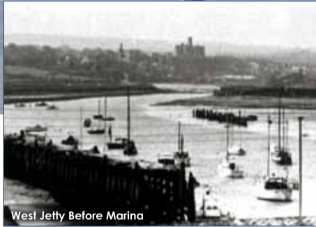
West Jetty Before Marina