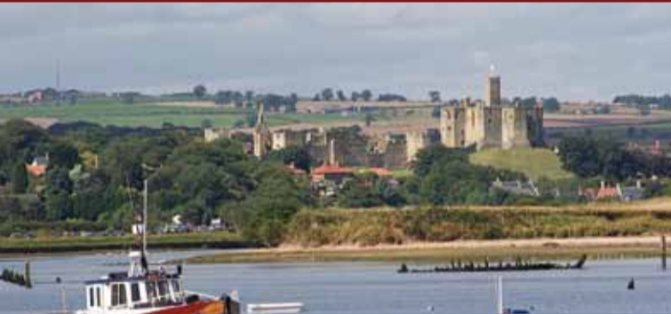
2007 - West Jetty Area