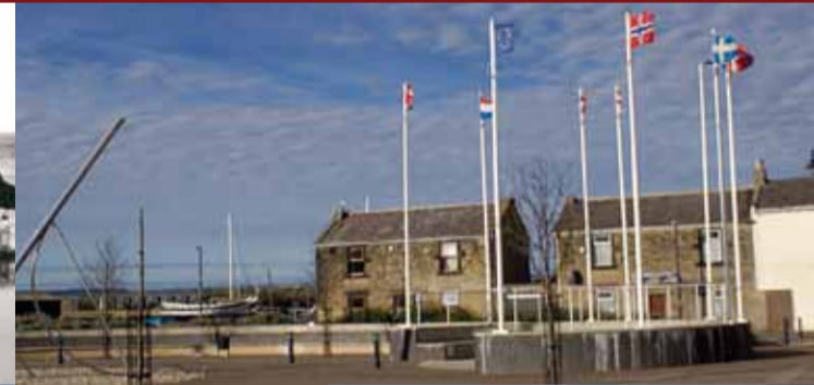
2001 Town Square